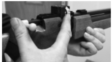
Away you go.