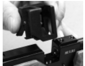
Drop into place